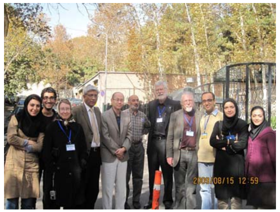
The opening ceremony preceded the congress. In this ceremony, for the first

The 19th Iranian Congress of Physiology and Pharmacology was held November 3-6, 2009 in Tehran, Iran. This meeting was organized by the Iranian Society of Physiology and Pharmacology (ISPP) and Shahid Beheshti University of Medical Sciences. The meeting venue was the Shahid Beheshti International Conference Center, which is in the heart of the university campus. The number of attendees was 1126 including 1098 Iranian and 17 other scientists from Armenia, Canada, Denmark, India, Japan, Pakistan, United Kingdom and USA.